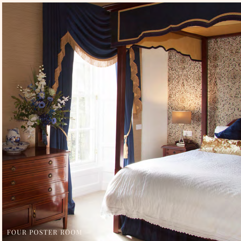
FOUR POSTER ROOM

Both our rooms enjoy stunning views to either Queen street gardens or over the city to the firth of forth. Stay the night before your big day & wake feeling refreshed & relaxed. Have breakfast in bed & know all you have to do is wait for your hair & make up team to arrive where you'll have plenty of space to get ready with your wedding party. Your new husband or wife can then join you for your wedding night & you can both wind-down in style after the best day of your life knowing everything is under one roof.